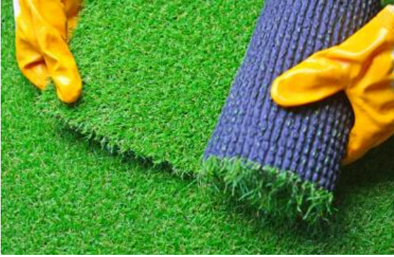
Installing artificial turf

2. Regular Maintenance: Regular maintenance, such as brushing and vacuuming, can help keep the recycled rubber infill in place and prevent it from being released into the environment. Regular monitoring and inspection can also help identify areas where the recycled rubber infill may have become dislodged, so that appropriate corrective action can be taken.